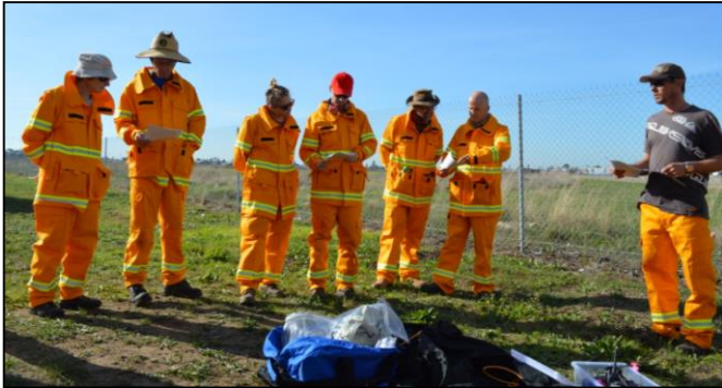
Pre burn briefing – Practical Ecology staff looking all fresh and ready for action in their new PPE

The burn day was an exciting day for all staff with weather conditions being ideal; 20°C and a light north-easterly wind. The day started with a pre-burn briefing, detailing the objectives; with the main aim being to burn 60–90% of the above-ground grassy biomass.