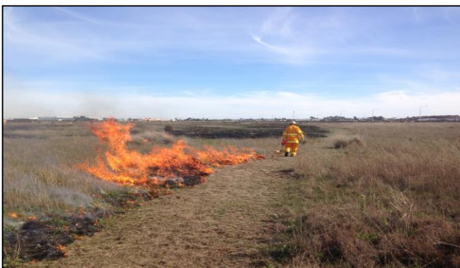
Lighting starter fires along the slashed control line.

Lighting of the grassland was achieved by igniting the grassy biomass with a drip torch, using a variety of spot and strip lighting patterns. All effort was made to manage and minimise the amount of smoke generated, which is always a hard task, in light of the reserves being located nearby a built up and busy urban area.