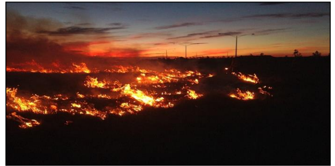
The prescribed burn continued until just after sunset, and were completed by 6pm

renowned for their association with fires – as they search for reptiles, small mammals and even large insects fleeing from the fire-front ( http://www.birdsinbackyards.net/species/Milvus-migrans ).