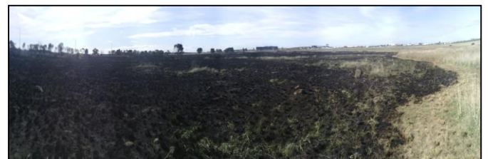
A panoramic view of the successful prescribed burn at Williams Landing, as seen the following day.

The following day as the smoke had cleared and no burning or smouldering embers could be found throughout the blackened grassland. Thus, revealing the successful outcome of the Practical Ecology Burn Team’s efforts in achieving the objective to reduce the built-up thatch and grassy biomass. The burn has opened up and exposed gaps in the grassland, in which a flush of new plants can grow, which will assist Practical Ecology’s contracting staff to continue to manage and aid in the restoration of the grassland.