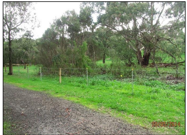
Abbey Walk, Vermont – 20/05/2014

Other examples of projects in which photopoint monitoring is currently being, or has been undertaken by Practical Ecology: