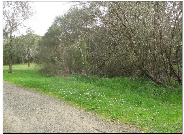
Abbey Walk, Vermont – 27/08/2013